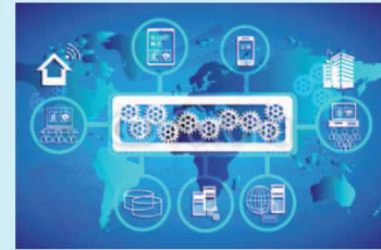
Figure 3: TAMS4CPS brochure/project flyer inside